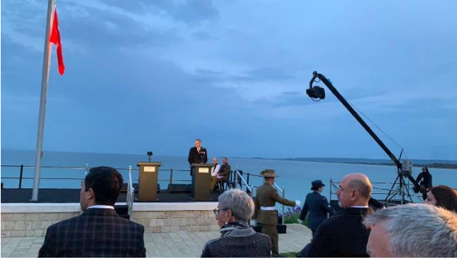
Australian and New Zealand commemorations - - 25/04/2023