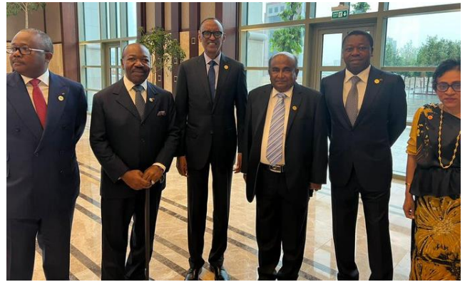
Speaker and the Ambassador with the President of Rwanda, President of Togo and other dignitaries.