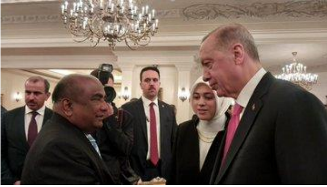
At the dinner Hon. Speaker had an opportunity to interact with the Turkish President, H. E. Recep Tayyip Erdoğan.