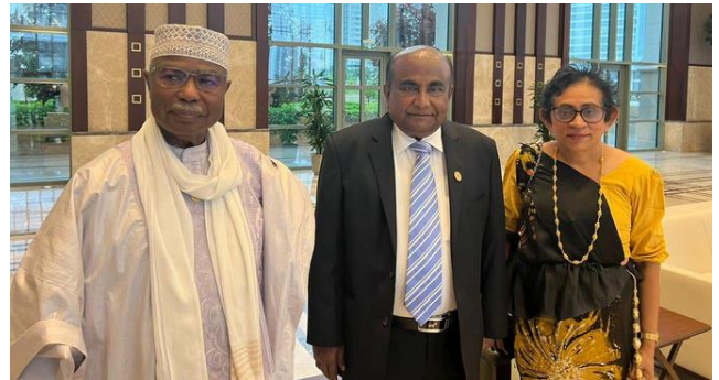
Speaker and Ambassador with Secretary General of the Organization of Islamic Cooperation (OIC).