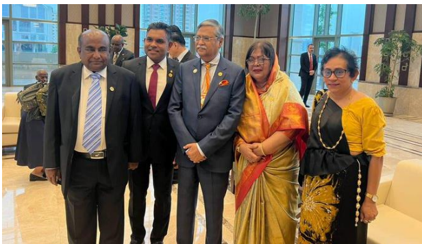
Speaker and the Ambassador with the President of Bangladesh, his spouse, and the Vice President of Maldives.

At the Dinner hosted by the Turkish President at Çankaya Mansion - 03/06/2023