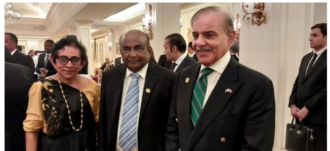
Speaker and Ambassador of SL with Pakistani PM.

Speaker meets foreign dignitaries at the Presidential Palace - 03/06/2023