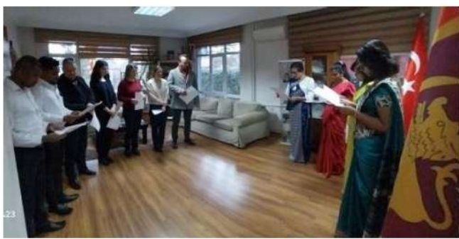
The seminar on "History of Sri Lanka- Türkiye Relations" at Ankara Social Science University – 11/01/2024

The Ambassador of Sri Lanka delivered opening remarks on bilateral diplomatic relations during the seminar "History of Türkiye -Sri Lanka Relations" at the Ankara Social Science University.