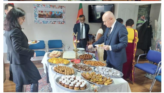
Diplomatic Reception celebrating 76th Anniversary of Independence of Sri Lanka -05/02/2024

The Sri Lankan Embassy in Ankara, Türkiye organized a Diplomatic Reception at the Anemon Ankara Hotel, attended by Turkish politicians, officials, business community, academia, cultural and civil society representatives, as well as Diplomatic Corps, UN, and other international agencies' staff, over 380 persons.